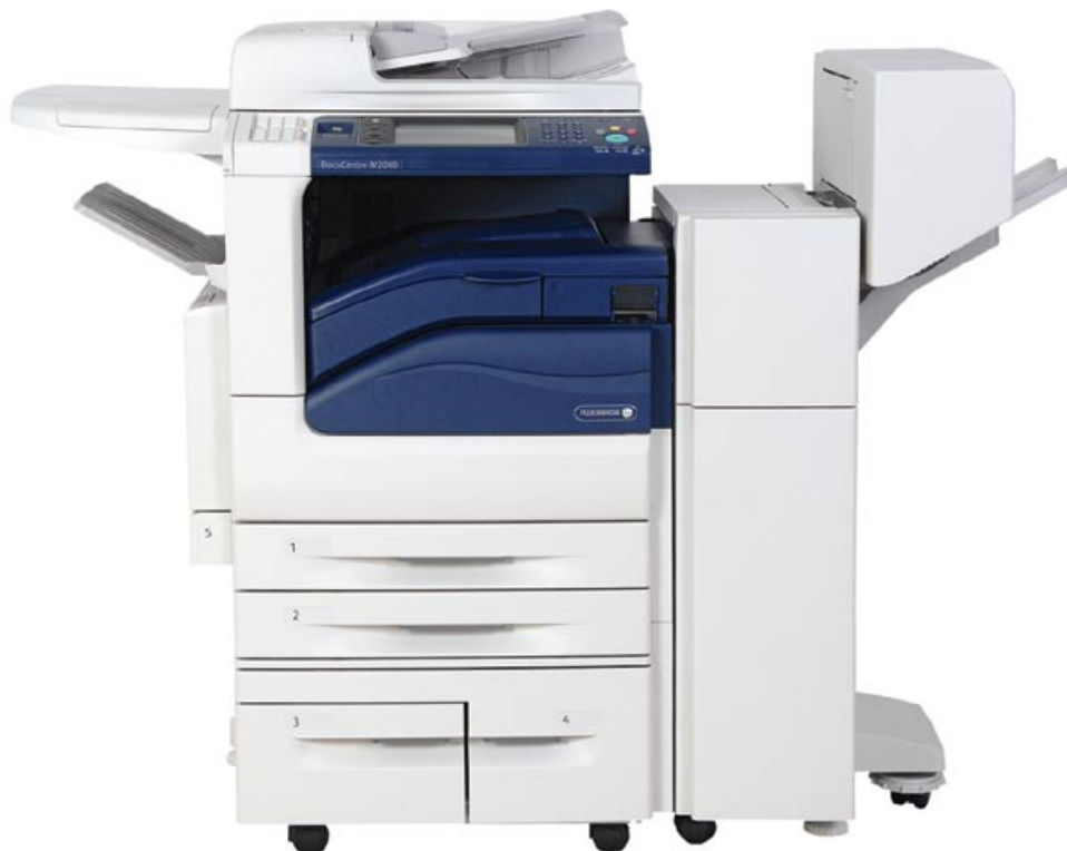
DocuCentre-IV 2060 with optional Wing Table, High Capacity Tandem Trays and Booklet Finisher